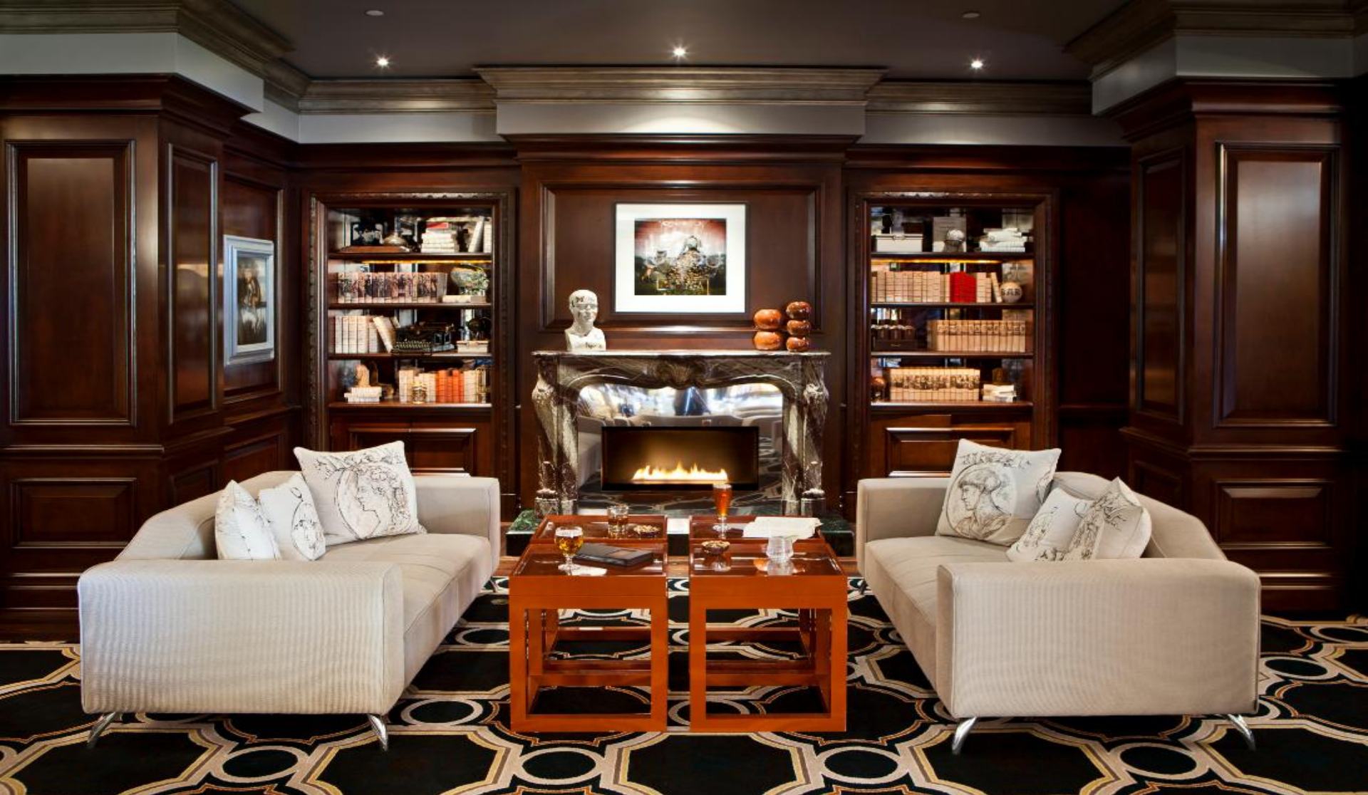
THE HOTEL'S LOUNGE - THE TAP ROOM