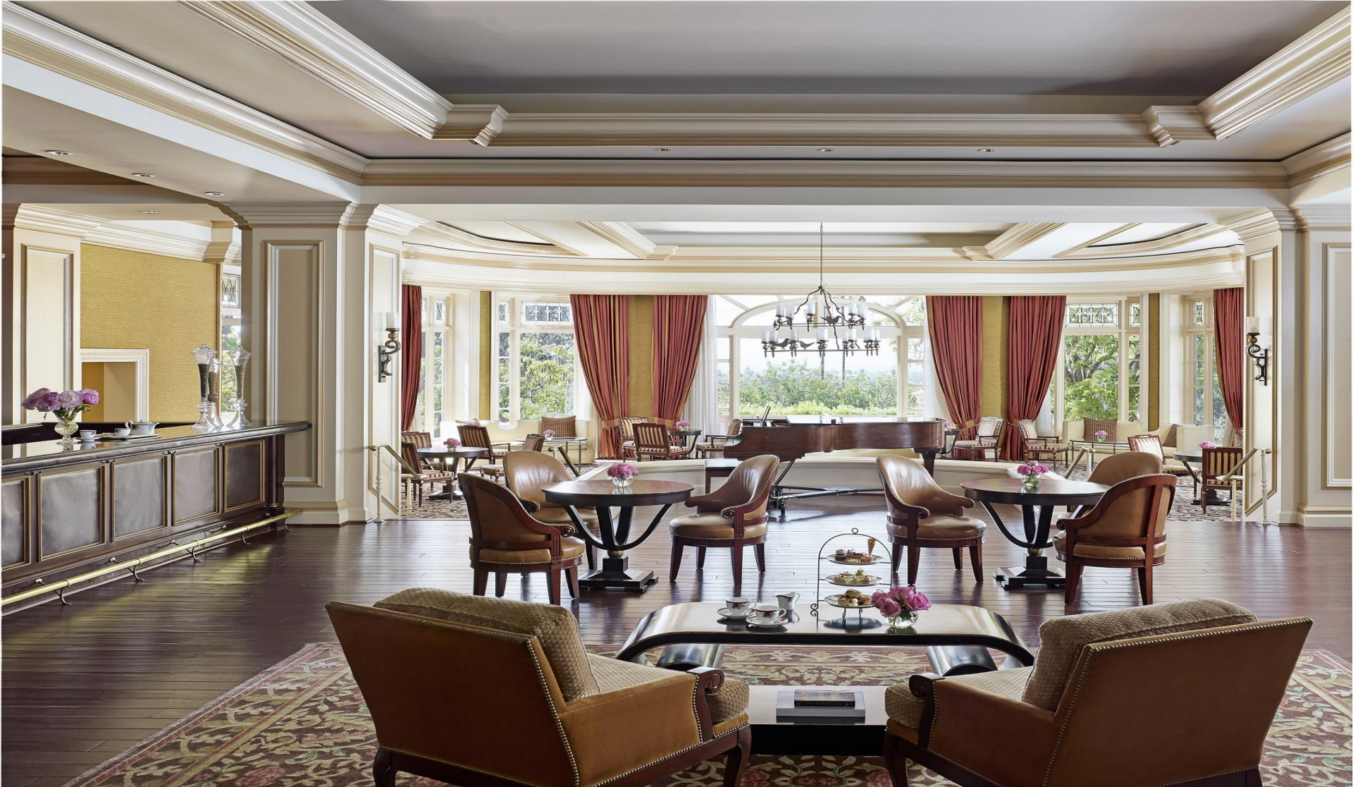
THE LOBBY LOUNGE