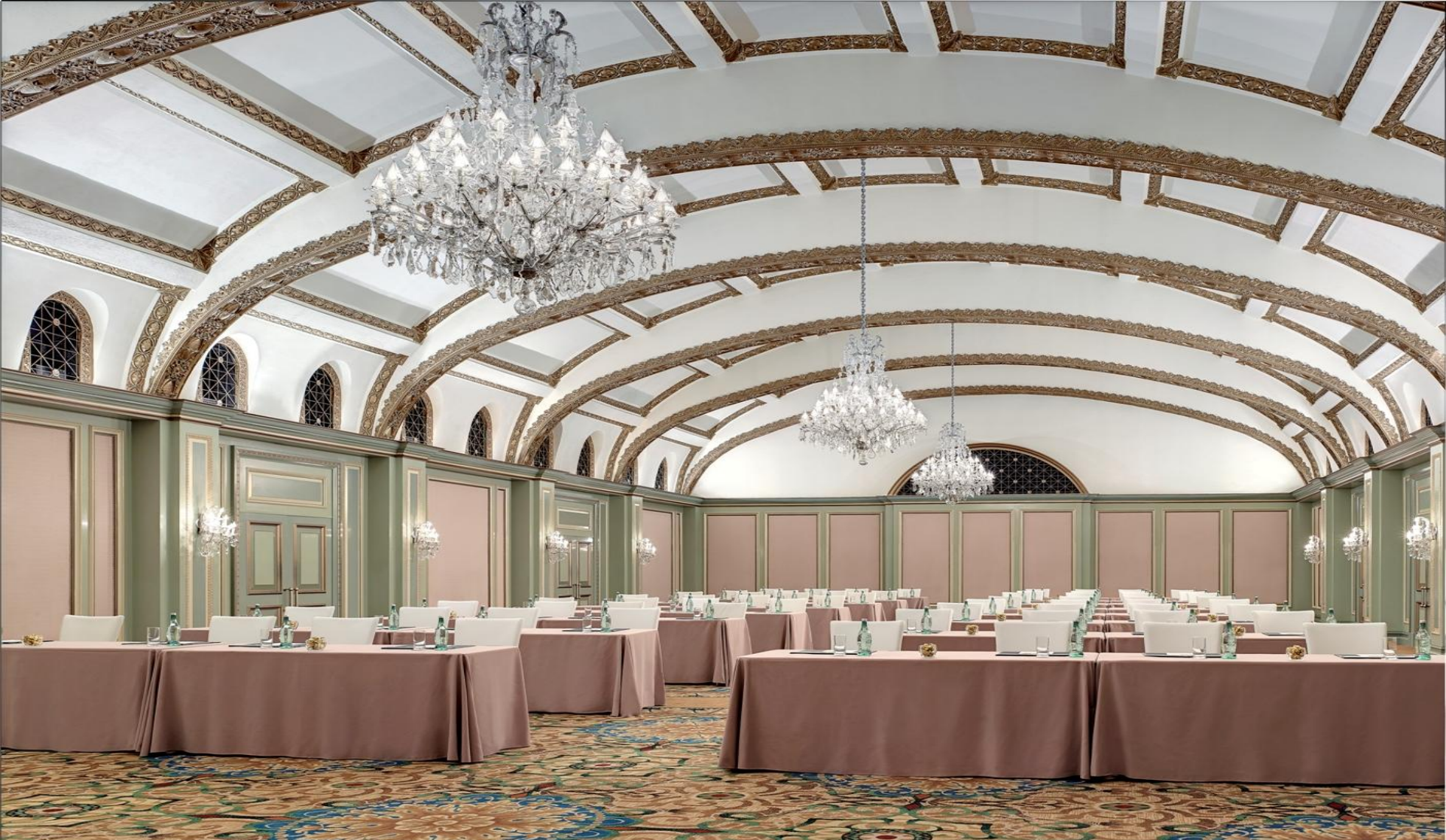
THE VIENNESE BALLROOM – 4,085 SF