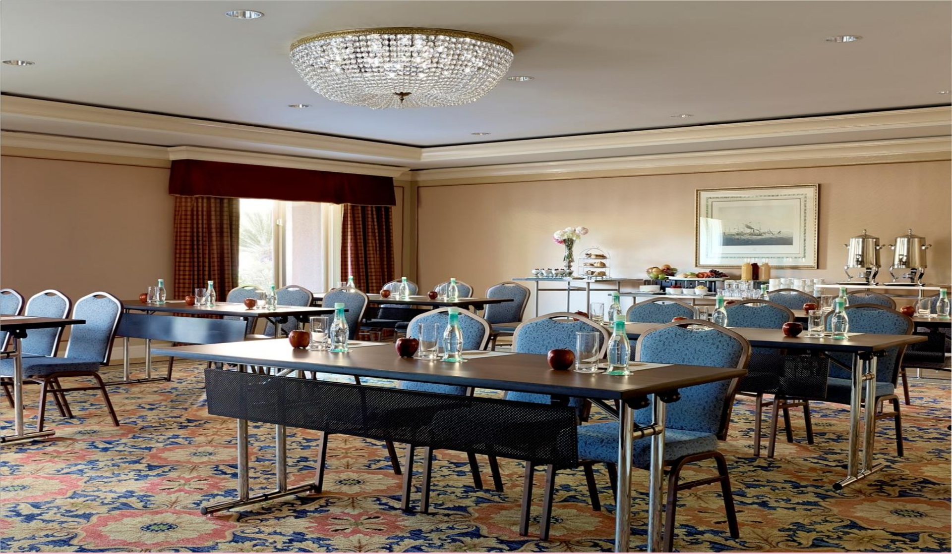
THE PLAZA – 750 SF