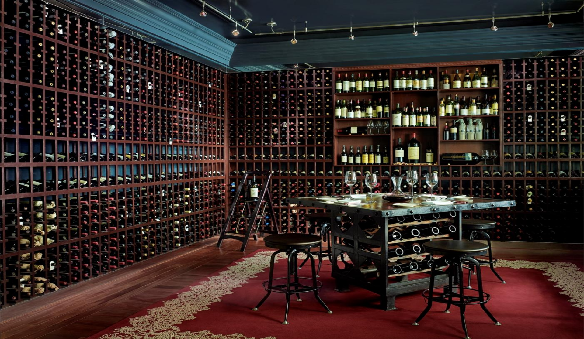
THE ROYCE - RED WINE ROOM