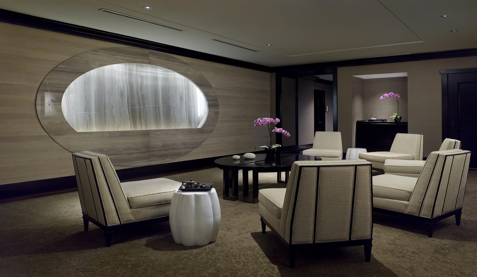
CHUAN SPA INNER WAITING ROOM