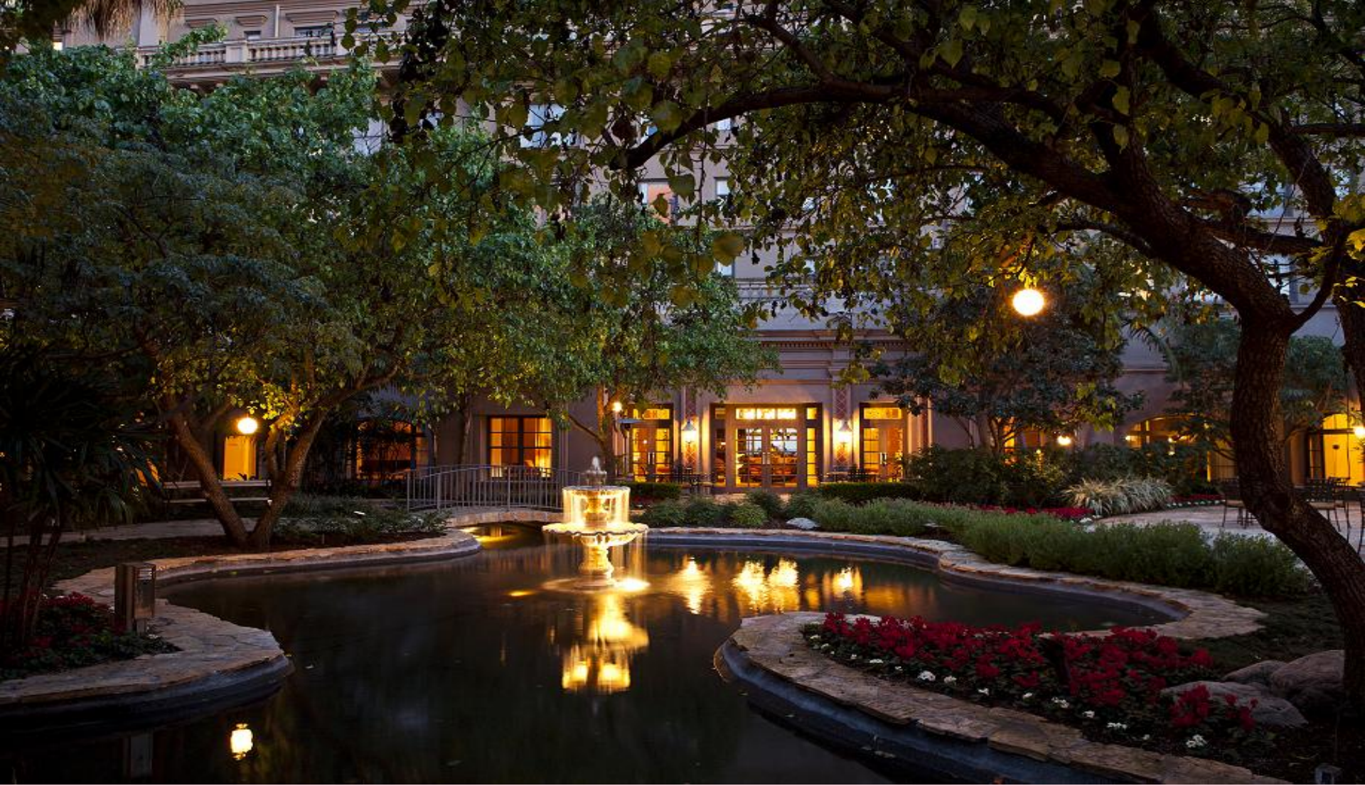
THE COURTYARD – 1,242 SF