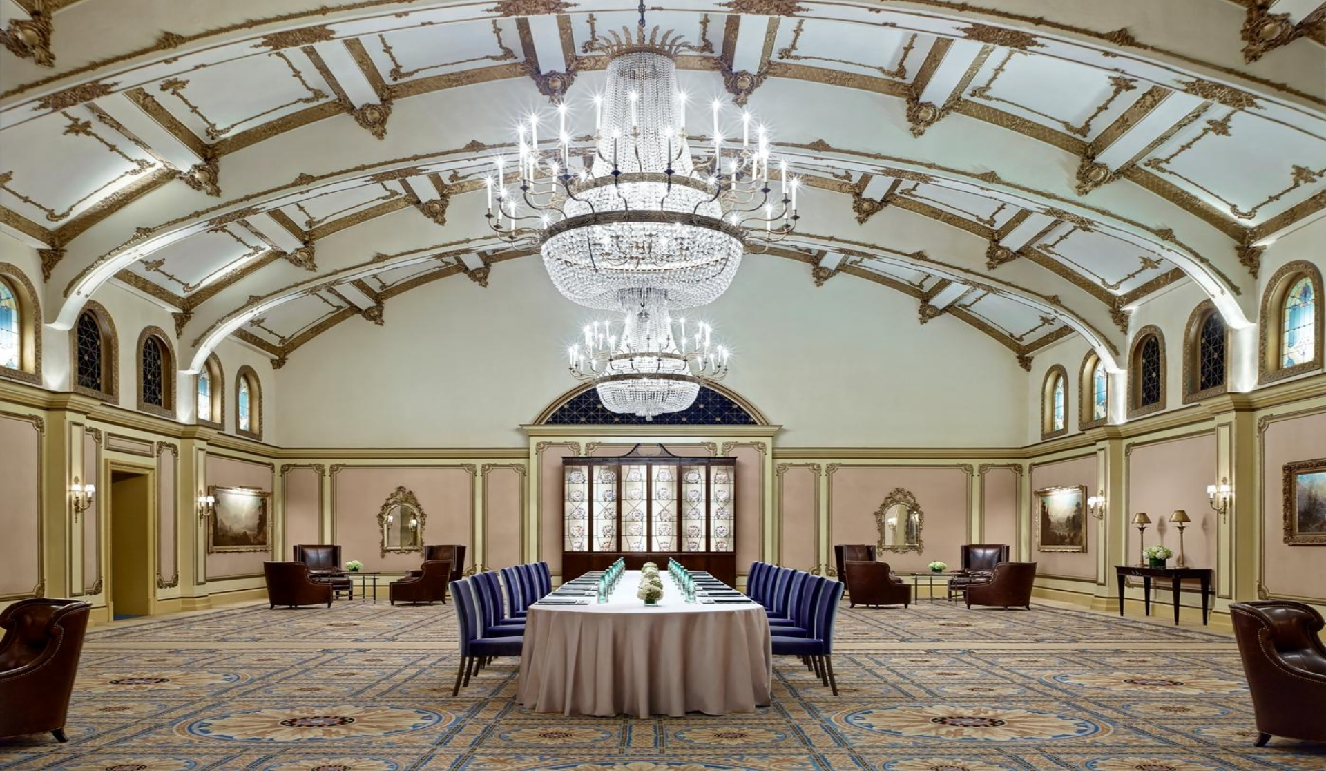
THE GEORGIAN BALLROOM – 2,610 SF