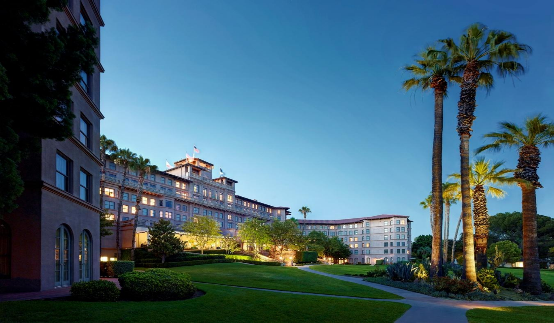
HOTEL'S EXTERIOR OVERLOOKING HORSESHOE GARDEN