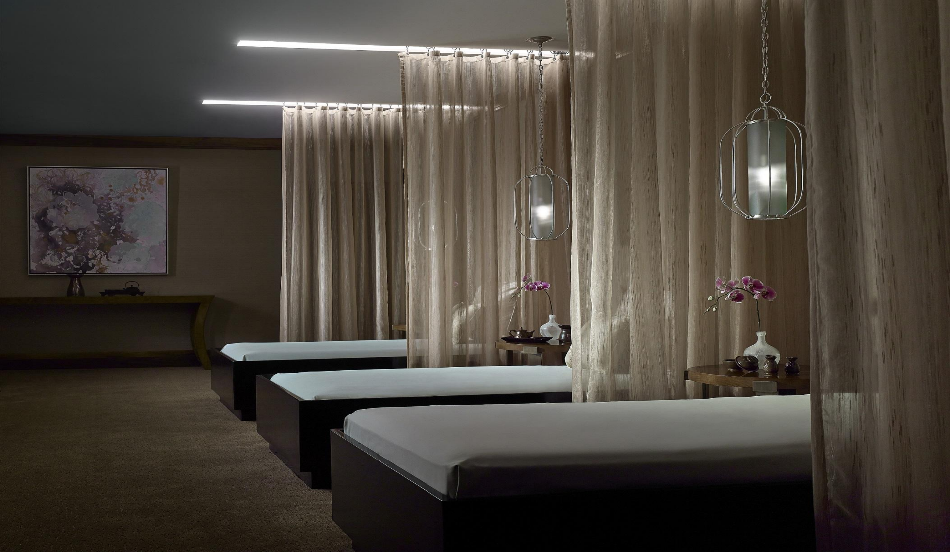
CHUAN SPA DREAM ROOM