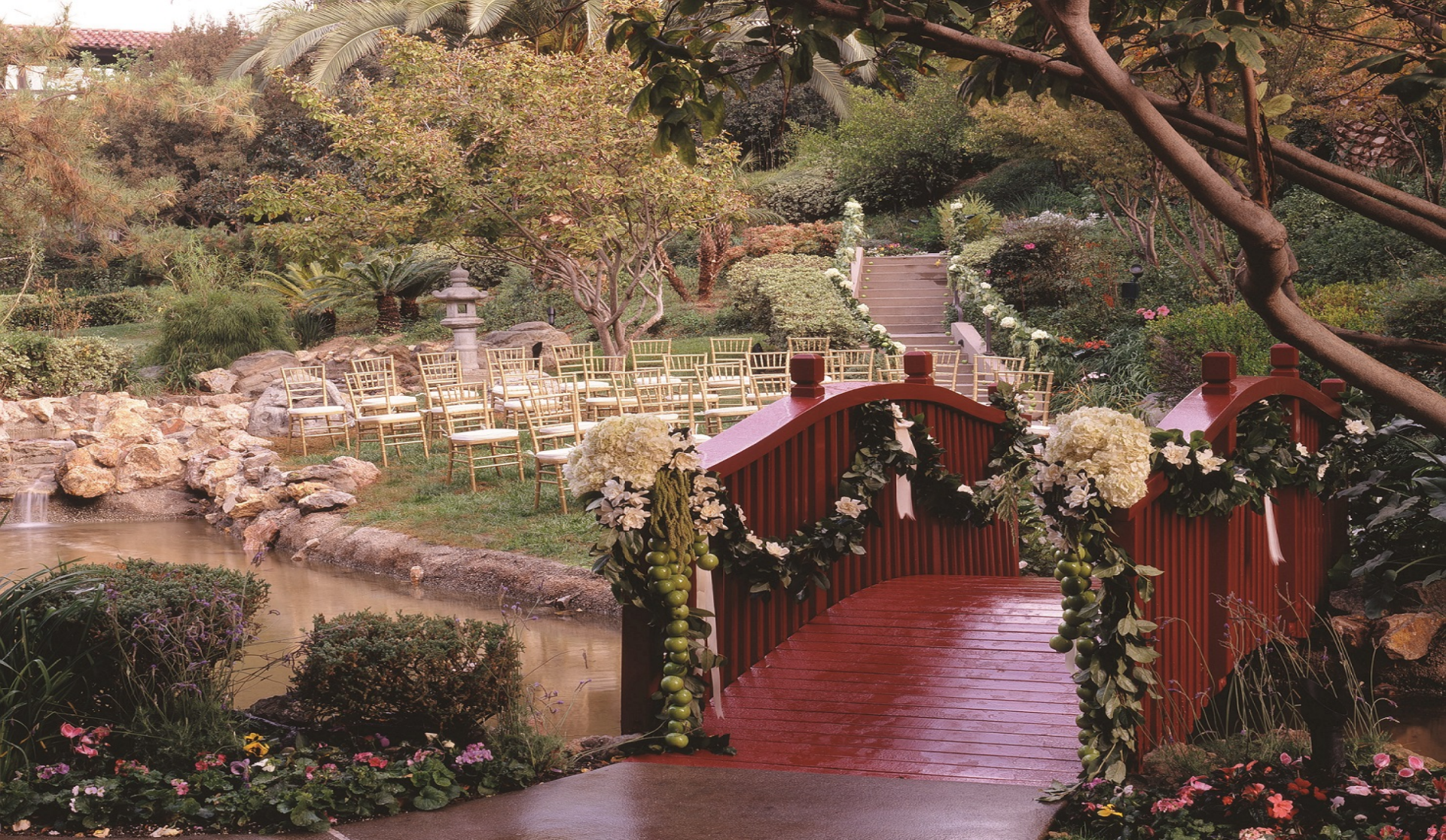
JAPANESE GARDEN – 2,000 SF