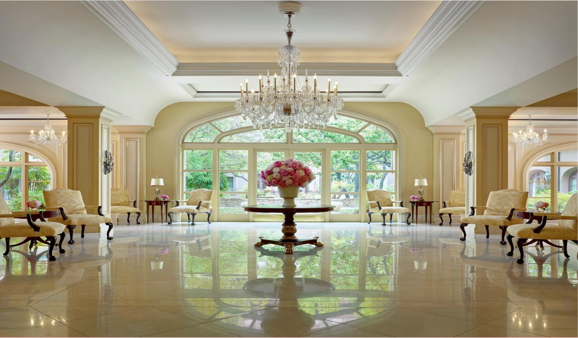
HOTEL MAIN LOBBY