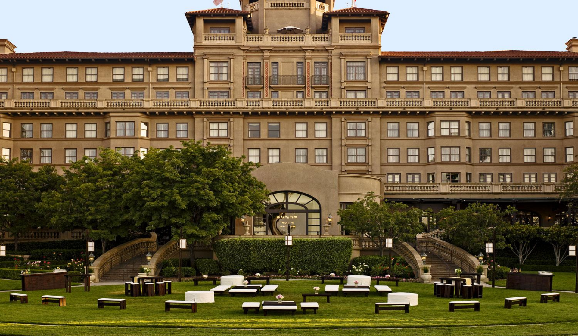
THE HORSESHOE GARDEN -11,500 SF