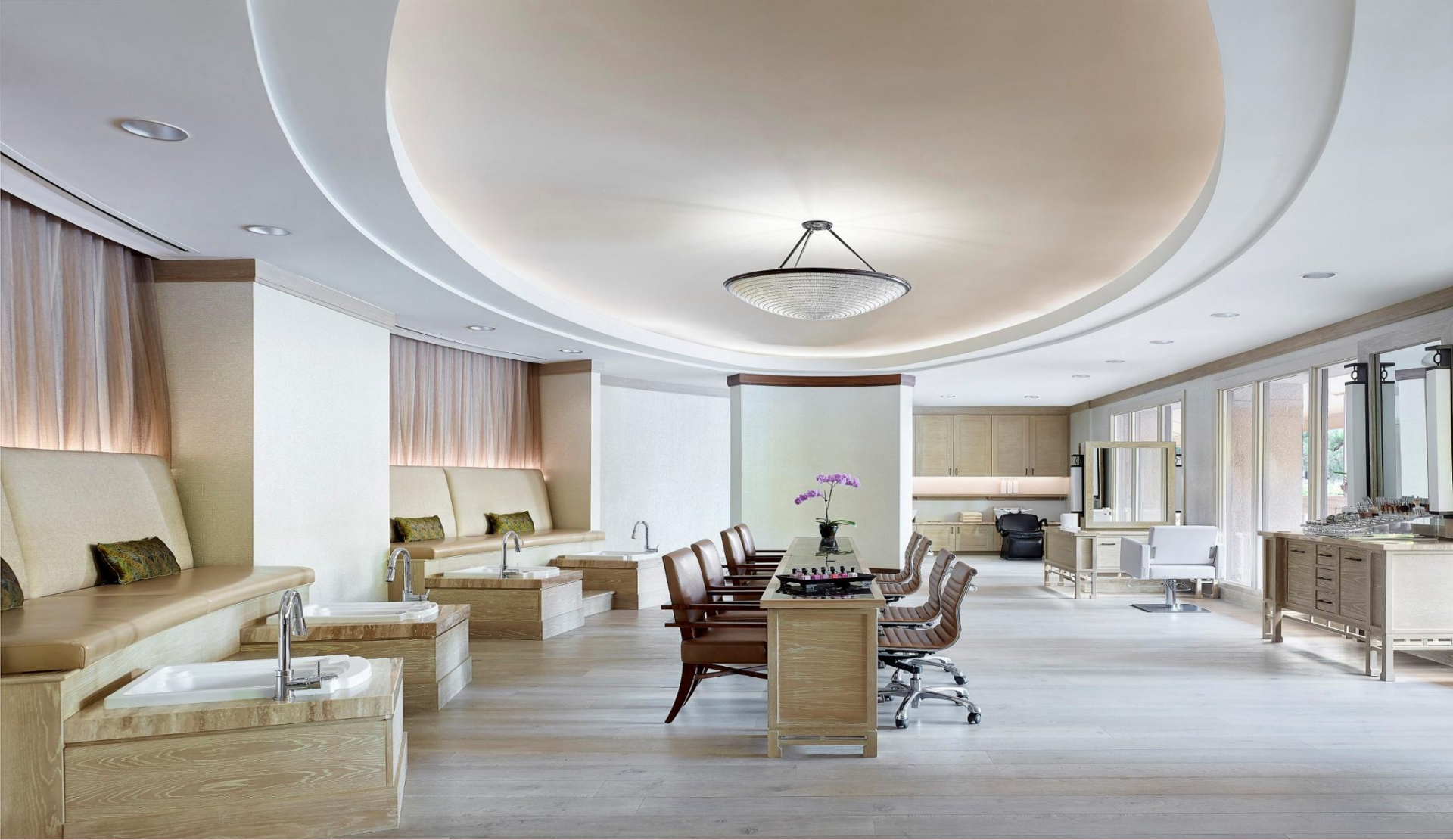
CHUAN SPA SALON