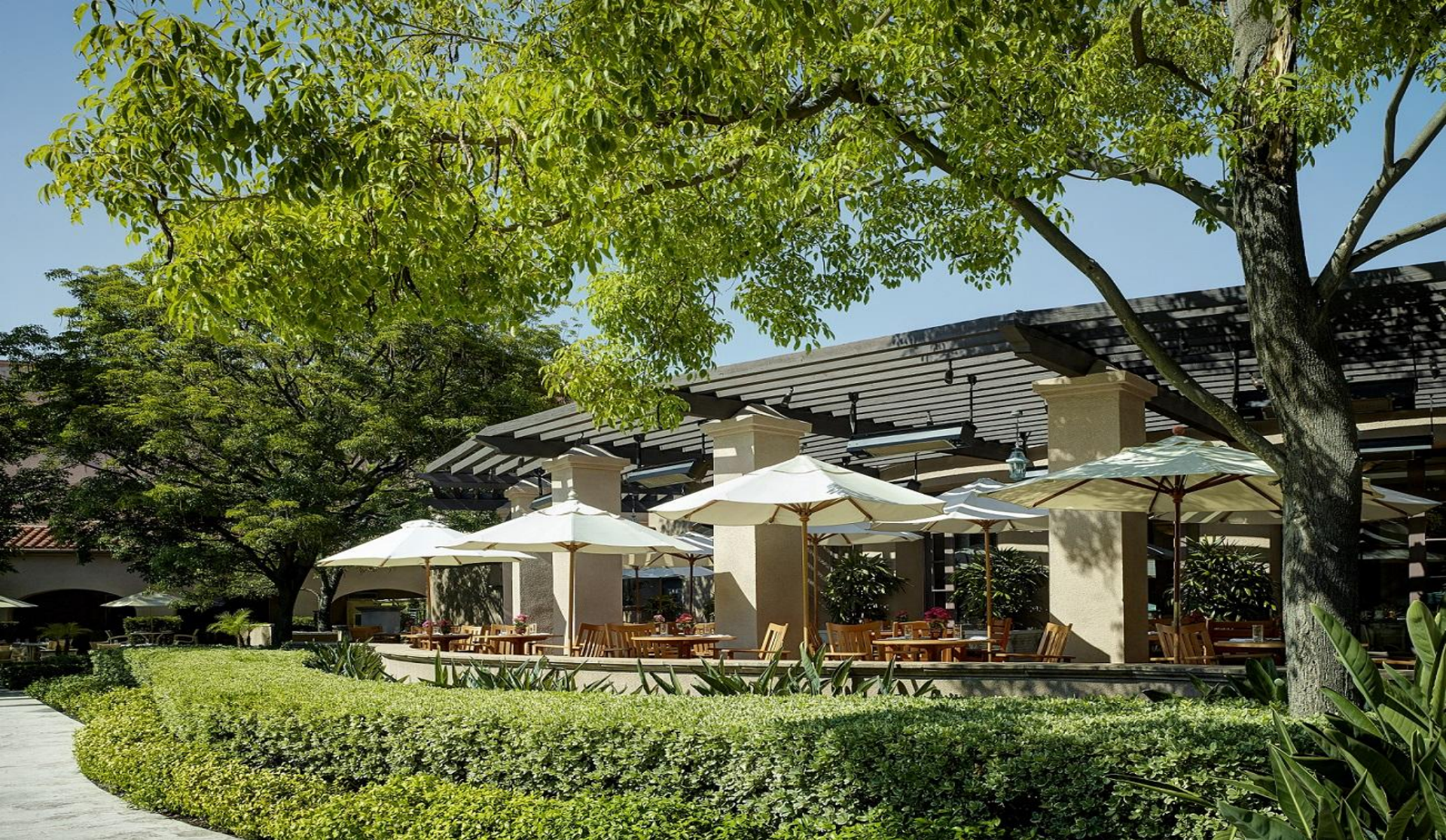
THE HOTEL'S THREE-MEAL CASUAL DINING RESTAURANT - THE TERRACE