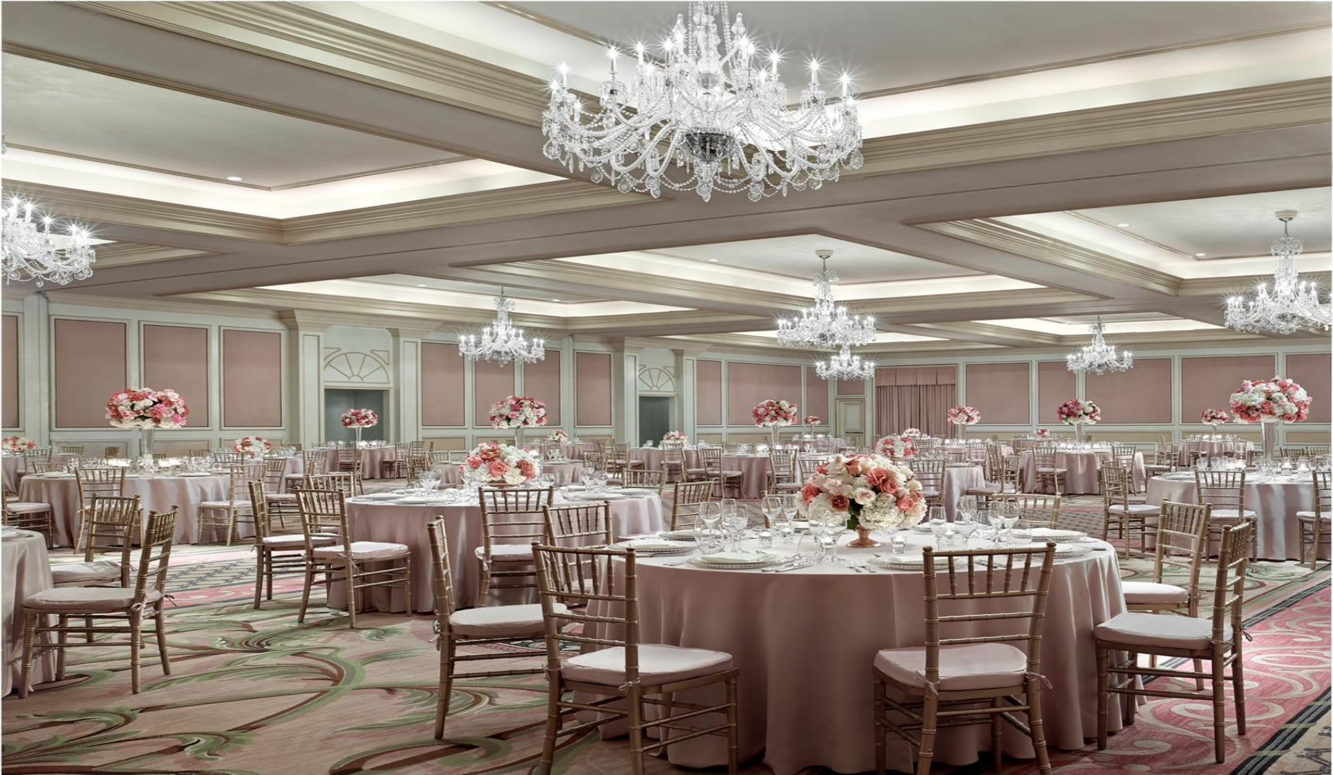
THE HUNTINGTON BALLROOM – 11,220 SF