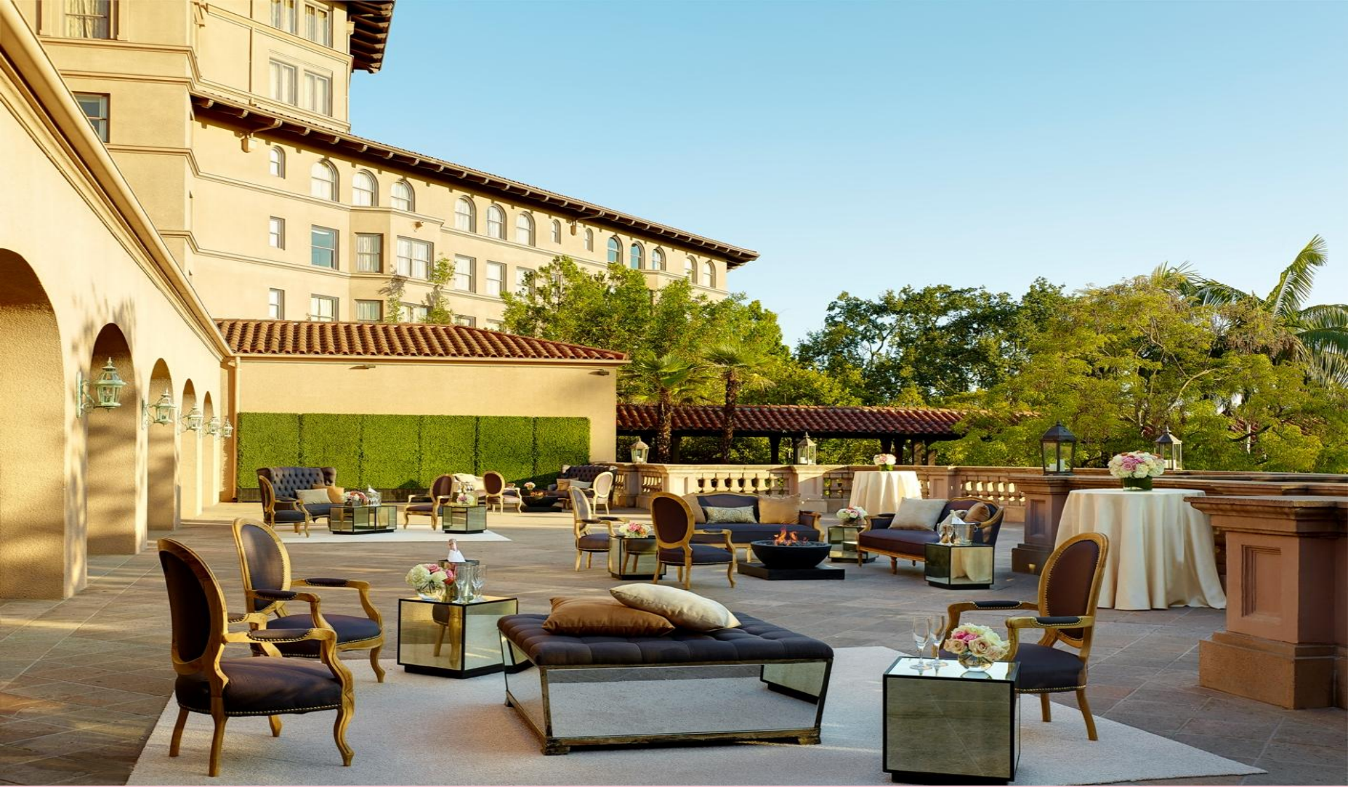
THE VIENNESE TERRACE – 3,500 SF