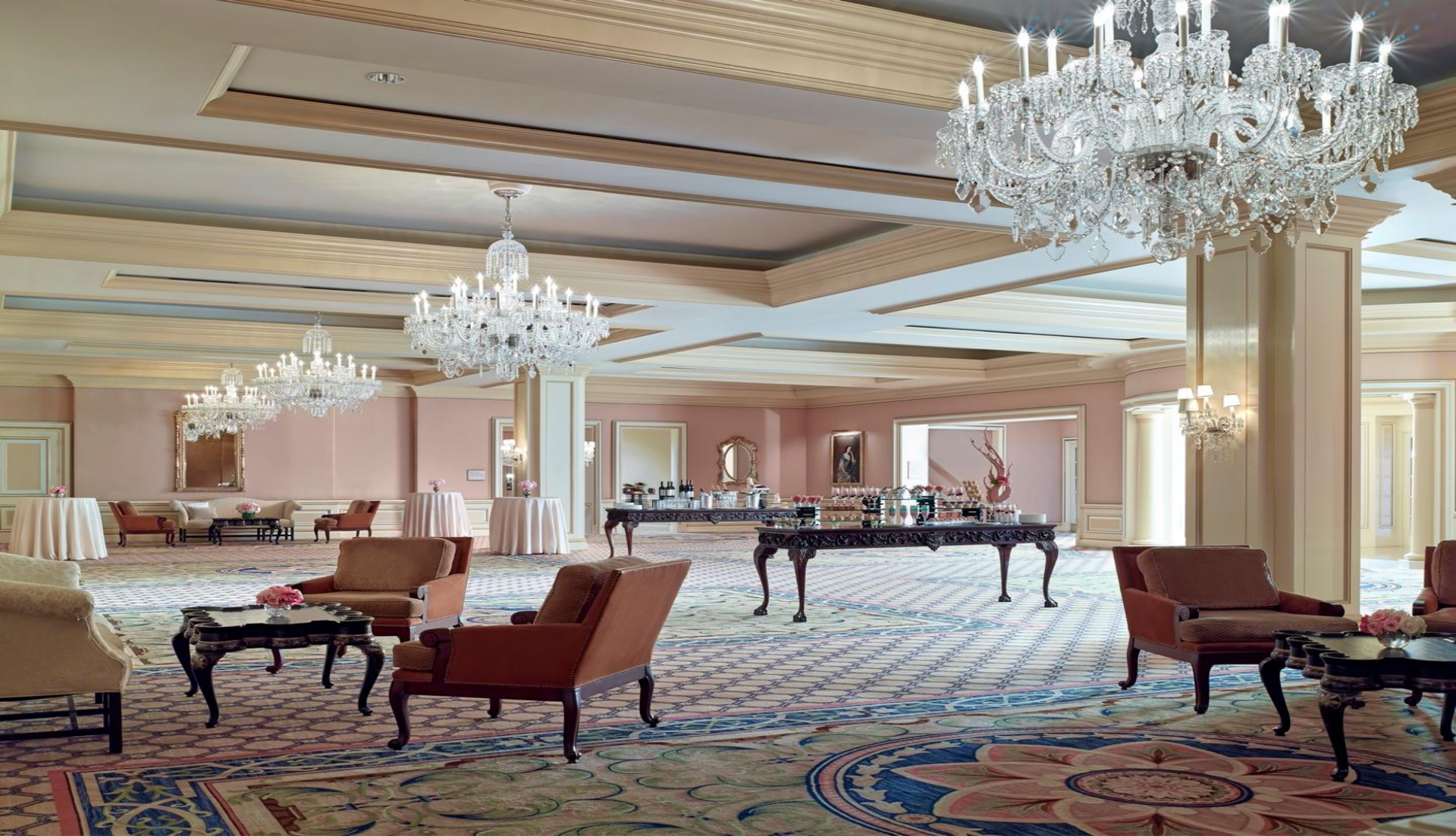
THE HUNTINGTON BALLROOM FOYER – 4,500 SF