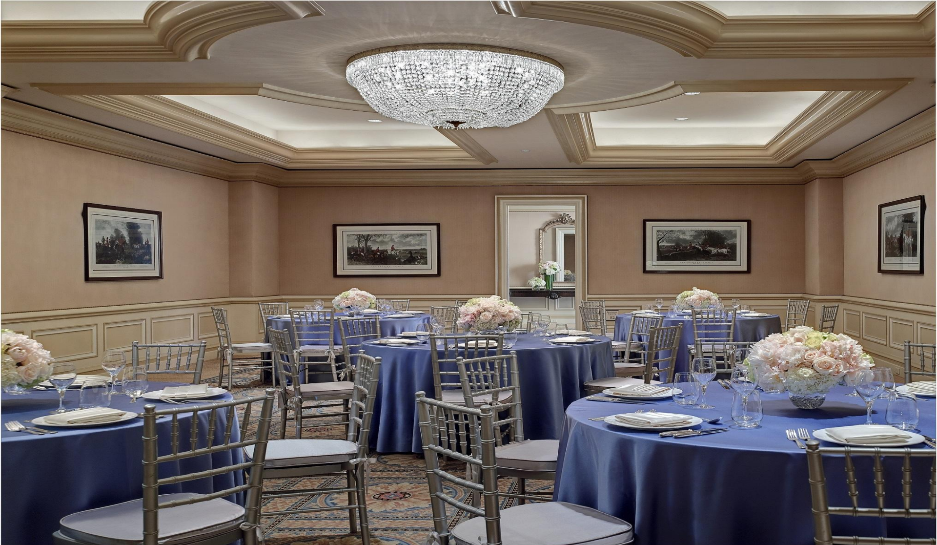
THE PROMENADE -1,008 SF